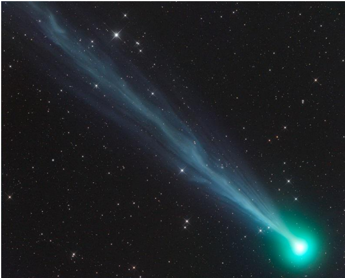
Comet C/2020 F8 SWAN 01 05 2020 - Farm Tivoli, Namibia/SW-Africa