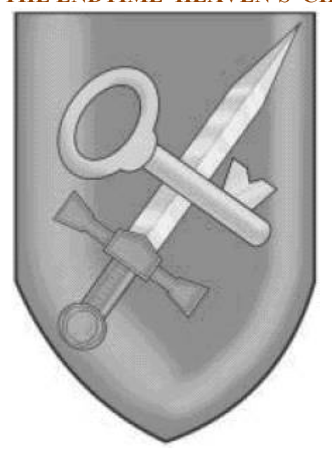
PART 2 - SOME BIBLE VERSES, KEY RINGS, KEY PROMISES, SPIRIT HELPERS, AND ENEMIES BY CATEGORY

© The Children of David 2017 Edited by theaudiokey.com